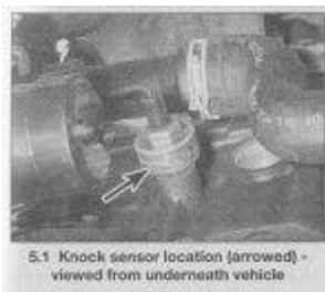
Figure 2: KS located on 1.6L 16v Corsa engine.

Initially the timing will occur at its optimal ignition point. Once knock is identified the knock control processor retards the ignition for that cylinder(s) by degrees. After knocking ceases the timing is advanced, but when knock returns, the ECU retards it once more. The process is a 'too and fro' one and the knock sensor and ECU are continually monitoring the engine to allow the optimum performance.