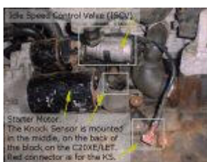
Figure 3: KS located on 2L engines.